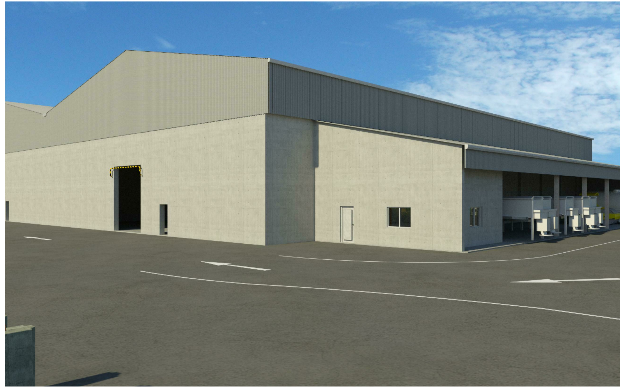
SALT BARN VIEWED FROM CHIP STORE AREA